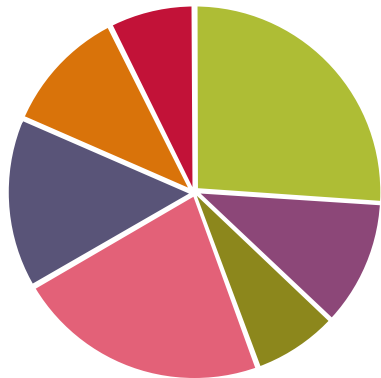
Employment Sector of IFST Members